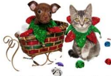
Merry Market Craft & Vendor Show